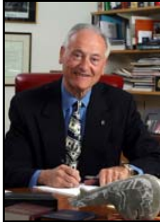
Richard F. Celeste Campaign Co-Chairman